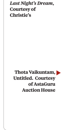
Thota Vaikuntam, Untitled .