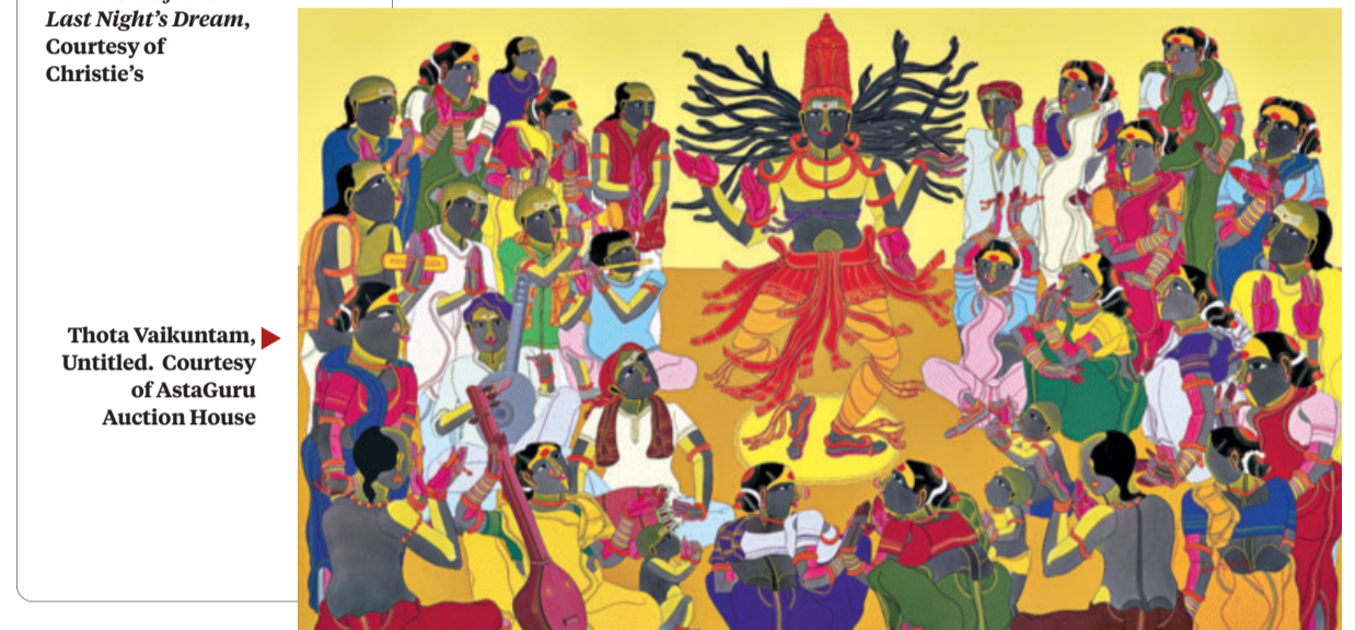
Thota Vaikuntam, Untitled