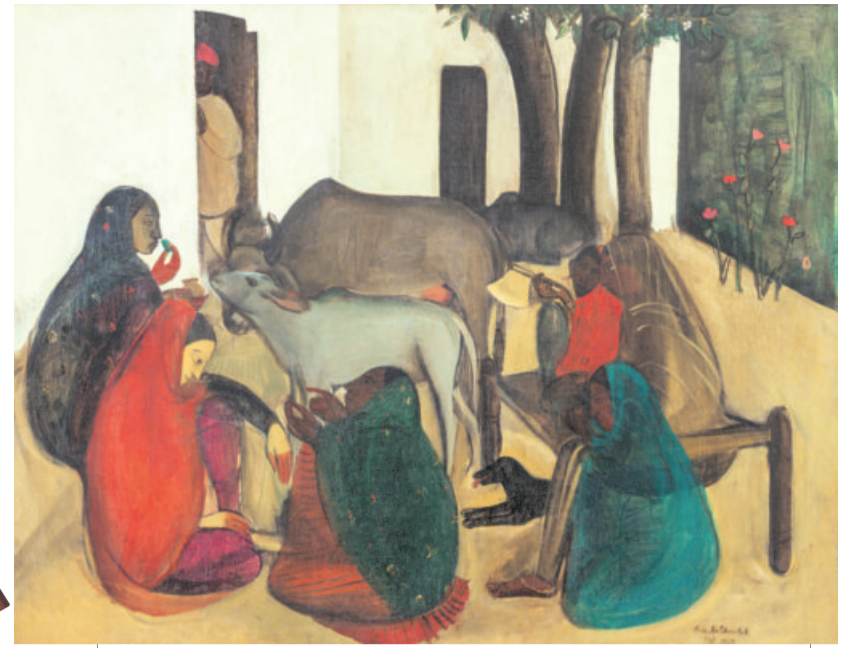
Amrita Sher-Gil, The Story Teller , 1937; sold for ₹61.8 crore, making it the highest-priced Indian artwork.